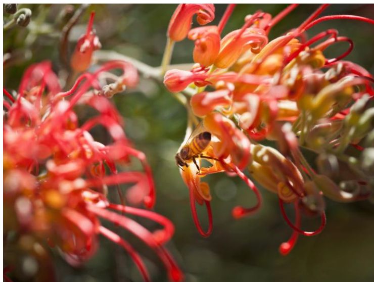
Grevilleas – In the Nursery now