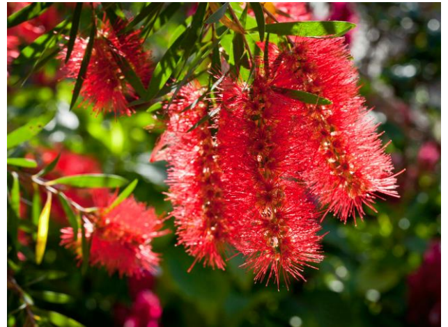
Bottlebrush – In the Nursery now

I invite you to come and explore the diverse range of native species that thrive in our region. Our dedicated team is on hand to offer expert advice and help you select the perfect plants for your garden and your region.