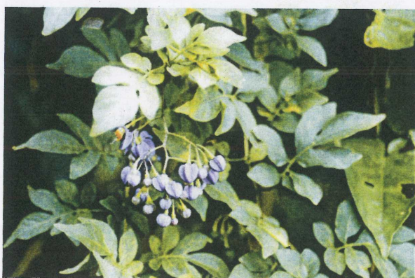
Brazilian nightshade (Solanum seaforthianum)

Also known as climbing nightshade, this South American vine was introduced into Australia as an ornamental climber. It is a fast growing plant that can smother native plants. The fruits are poisonous if eaten.