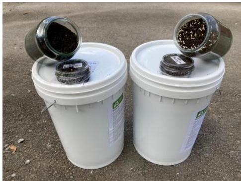
Did you know we are now selling our very own “home-made” potting soils and seed raising mixes?