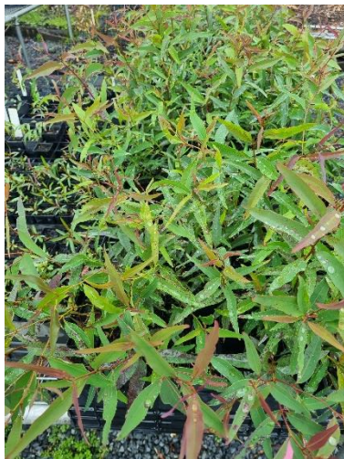
Left: Some Eucalypt species coming along nicely.