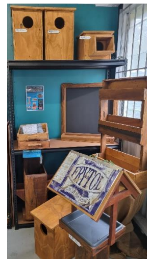
Right: Habitat boxes, bird feeders, vertical planter boxes and much more, all made right here at Gympie Landcare.