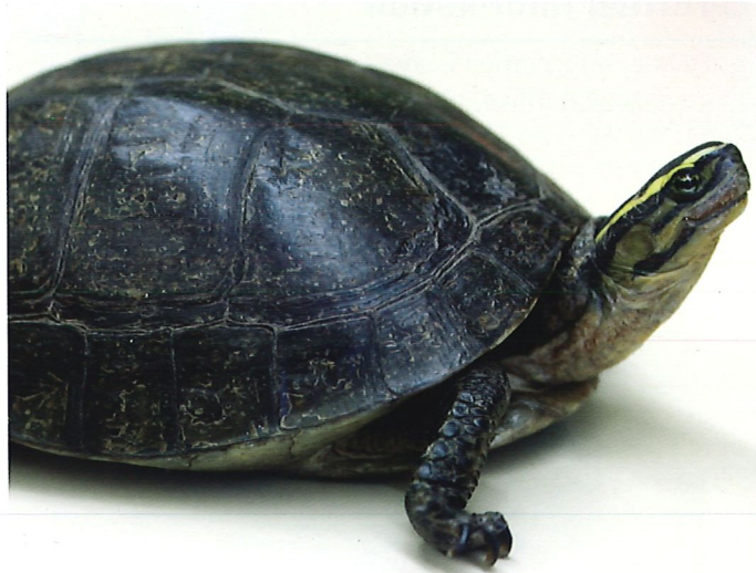
South East Asian box turtle ( Cuora amboinesis )