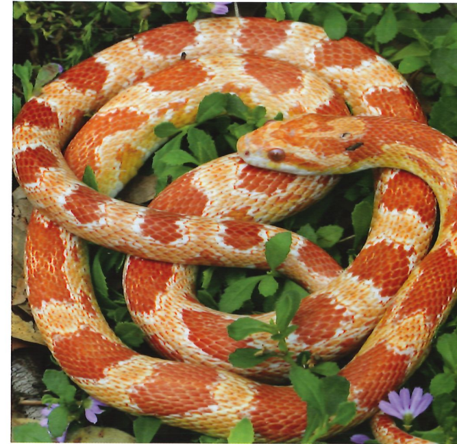
American corn snake ( Elaphe guttata )

This list was correct at date of publication but may change from time to time. For the most up-to-date version visit www.biosecurity.qld.gov.au .