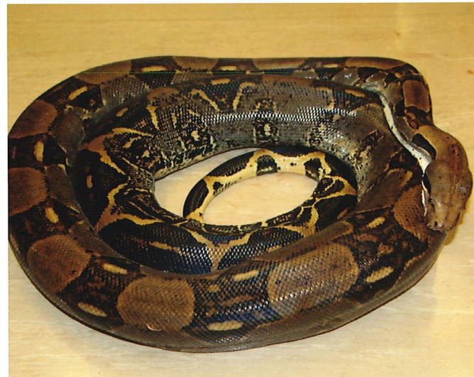
Boa constrictor ( Boa constrictor )