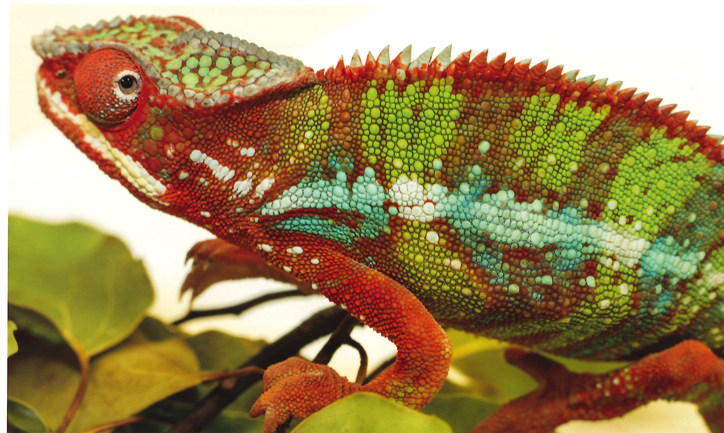
Chameleon ( Calumma crypticum )