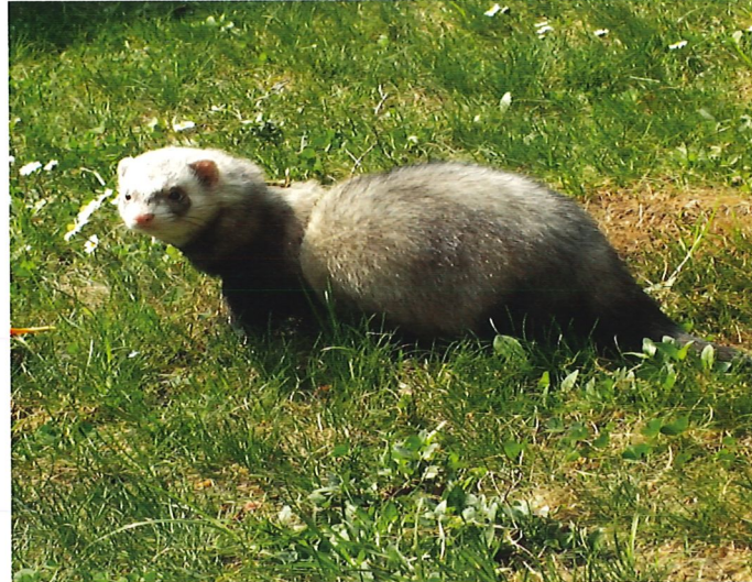
Ferret ( Mustela furo )