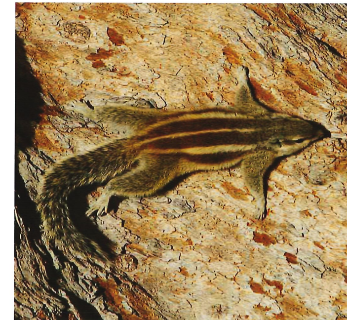
Indian palm squirrel ( Funambulus species)