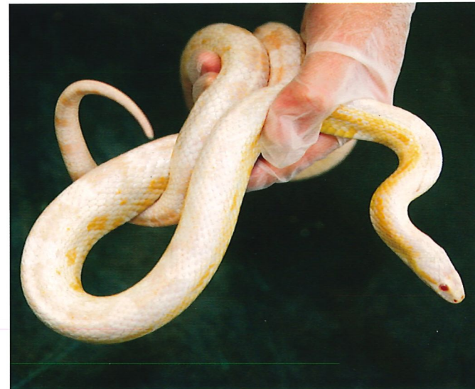
Albino American corn snake ( Elaphe guttata )