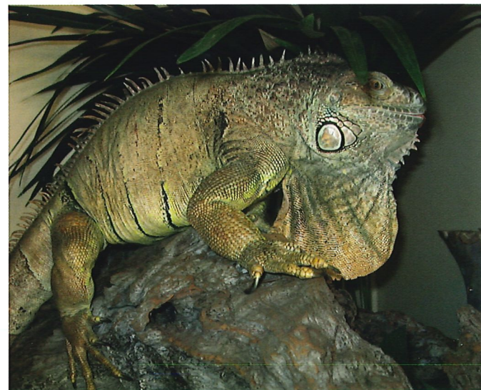
Green iguana ( Iguana iguana )